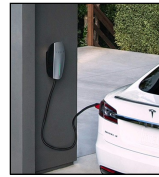
Tesla Home Charging