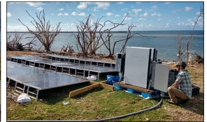
Deploying off-grid energy with the Tesla Disaster Relief Team in the Bahamas after Hurricane Dorian

If you're interested in working for Tesla Energy as a Licensed Electrician, Contact solarjobs@tesla.com or scan this QR Code to see the job listings.