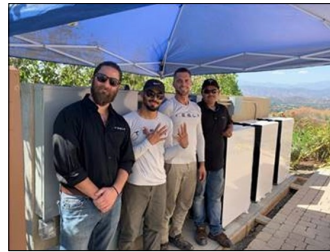
Installing nine Powerwalls on one system